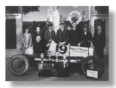
Hockaday & Harlow Car Parts now Part of Original Mike's