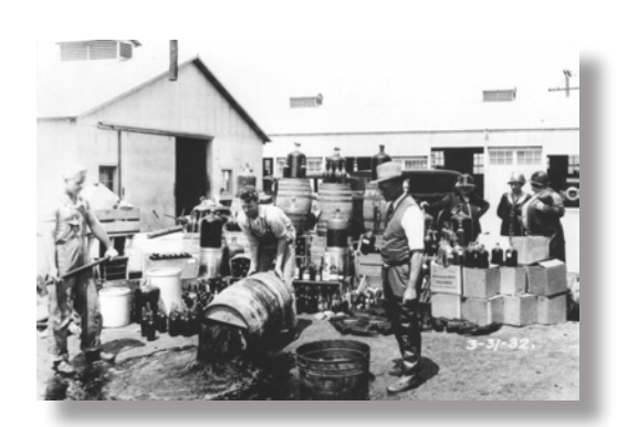
Santa Ana in 1932-cleaning up the "liquor"