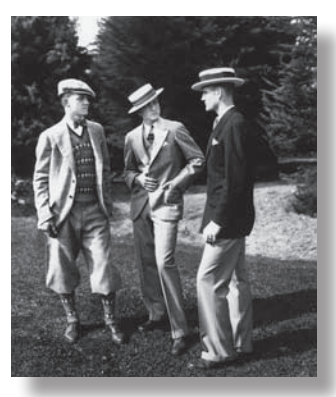
Santa Ana -College Men

Pesto Chicken Avocado Sandwich 10.95 Marinated chicken breast, jack cheese, lettuce, tomato, onions, avocado, and our special Italian pesto sauce, served on an Italian roll. Perfecto!