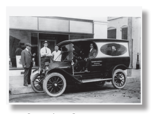
Santa Ana - Cigars any one?