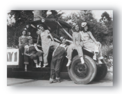
Santa Ana - May Day Parade

Chicken or Steak $3 Ahi Tuna, Salmon, Shrimp $4.5